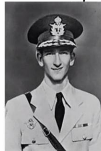
King Peter II Serbian Dynasty of Karadordevic

the last king of Yugoslavia, reigning from October 1934 until November 1945 when the Yugoslav Constituent Assembly formally deposed Peter and proclaimed Yugoslavia a republic; Peter settled in the United States after his deposition.