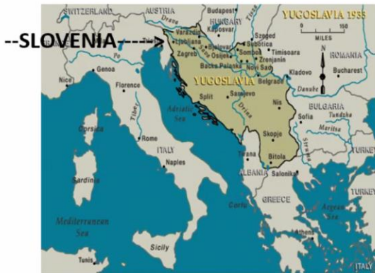
Map of Yugoslavia in 1935 Area in light green Yugoslavia upper left area Slovenia